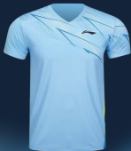
CHAMPION LIGHT BLUE