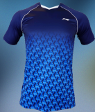
CLUB VICTORY 3D BLUE